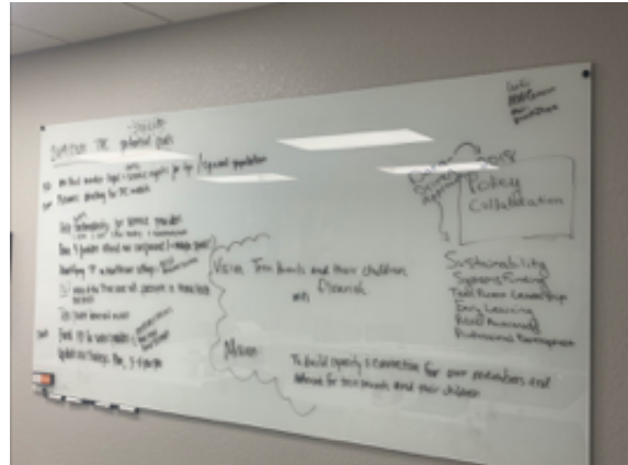
Leadership Team strategic planning and brainstorming in action.